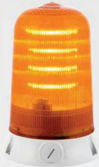
ROTALLARM S LED